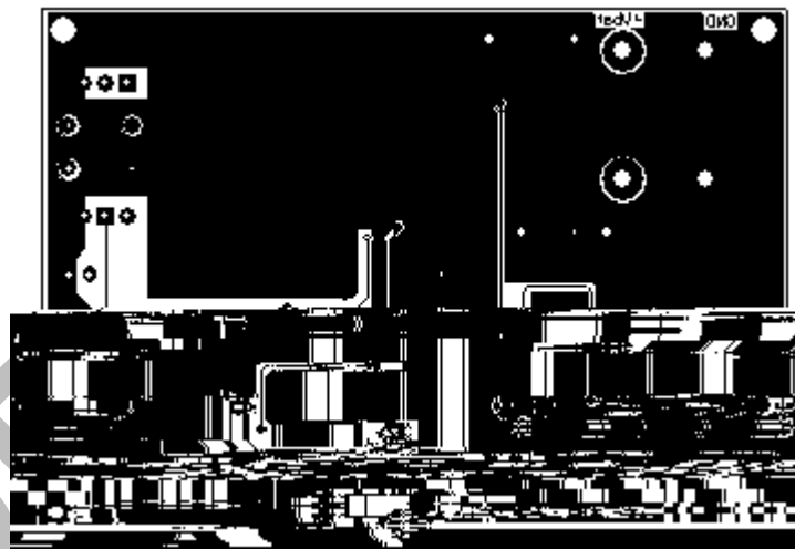
Figure 39. NCP5006 Demo Board PCB: Bottom Layer