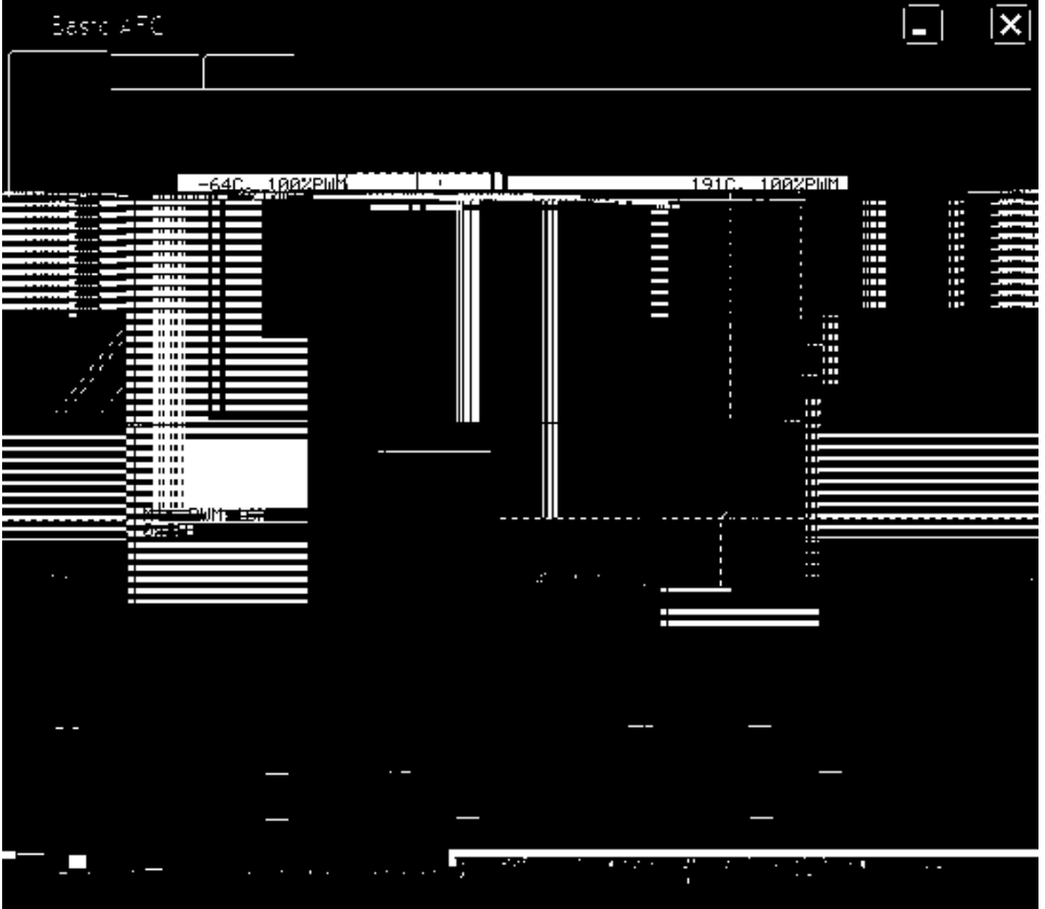
Figure 8. Automatic Fan Control Window